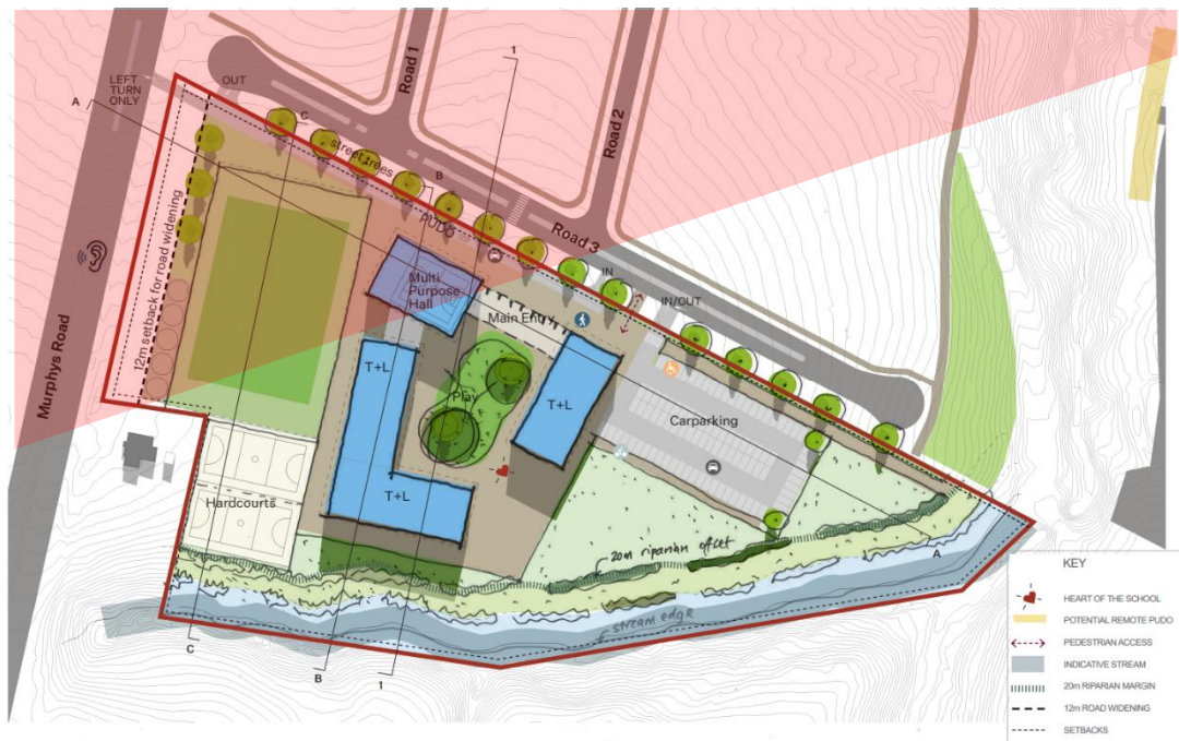
Figure 2. Indicative Site Proposal (55-60dB L dn Airport noise contour highlighted red)

An indicative proposal of the site (not yet finalised) is shown below in Figure 2, with the 55-60dB L dn airport noise contour of the ANNA also highlighted.